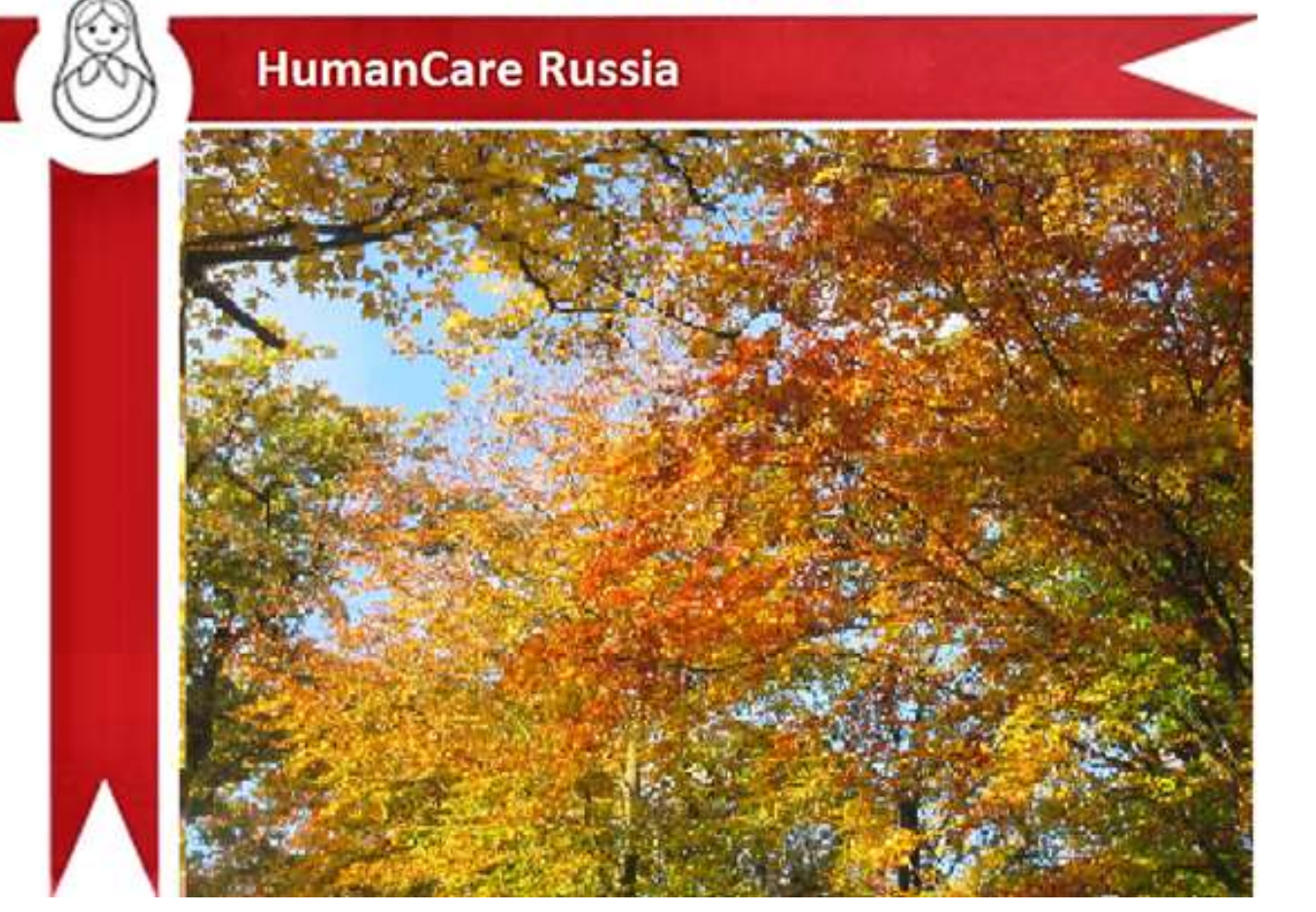
Dear all friends of HumanCare Russia We wish everyone a beautiful and blessed autumn